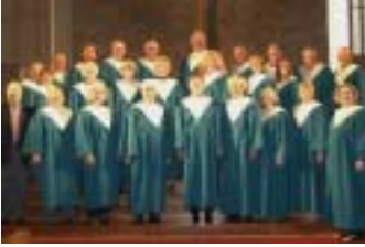
CPC Sanctuary Choir